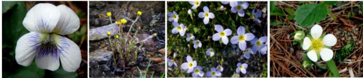
Early May roadside New Hampshire flowers (white violet, coltsfoot, bluets, wild strawberry)